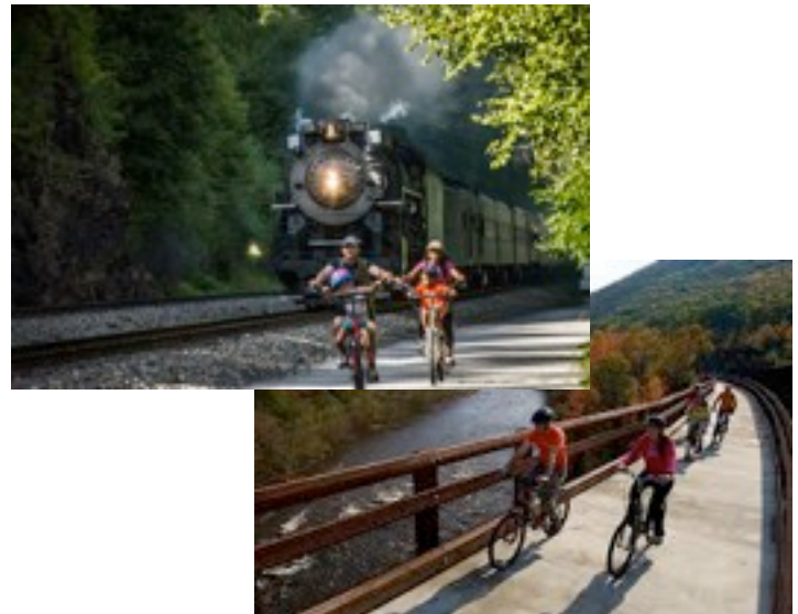
Lehigh Gorge Rail Trail

Tours: ghost, mansion, town museum old town jail (optional)